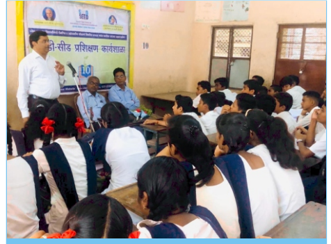
How to Face Exam?