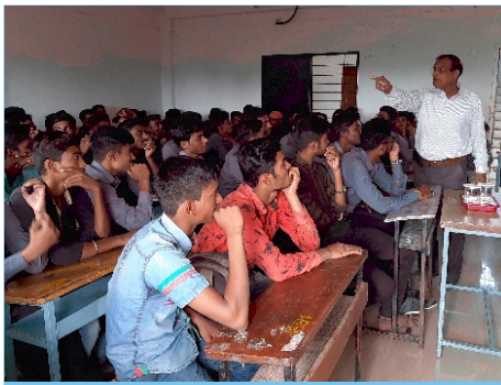
Soft Skill Development