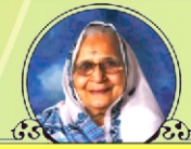
मातीश्री प्रेमाबाई जैन उच्च शिक्षण शिष्यवृत्ती योजना