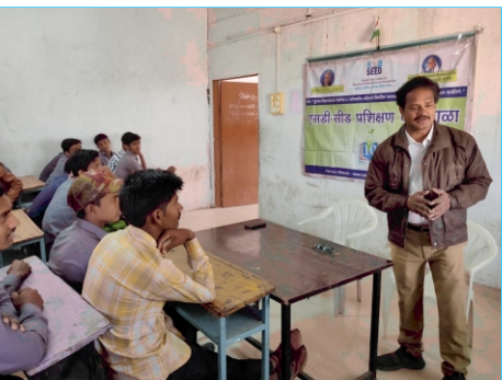
Oral English Communication