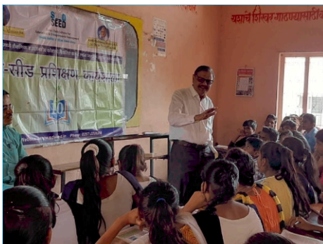
How to Face Exam?