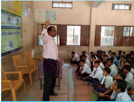
Soft Skill Development