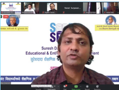
Development and Sharpening of Skills