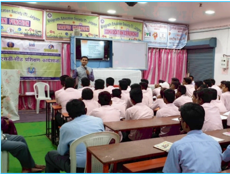
Entrepreneurial Development Guidance