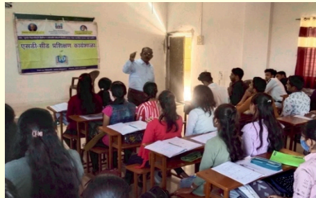
Interview Skill 1 Program