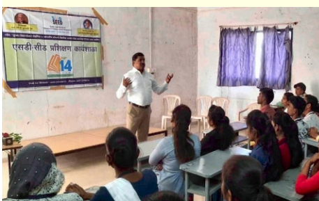
Goal Setting 2 Program