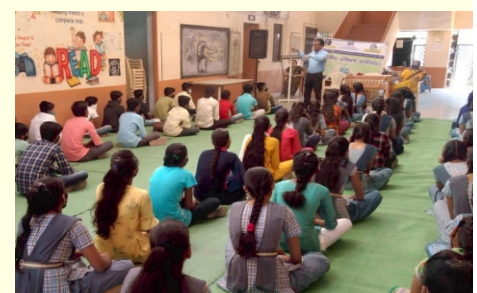
Develop Powerful Memory 1 Program