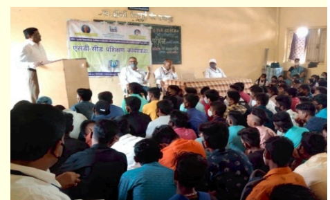
How to face Exam? 1 Program