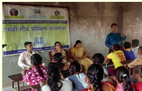
How to Develop Self Discipline 1 Program