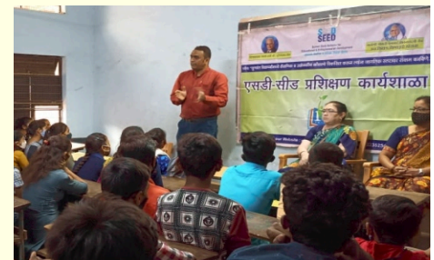
MS Office Application 1 Program