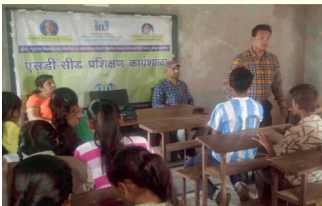
Develop Listening Skill 1 Program