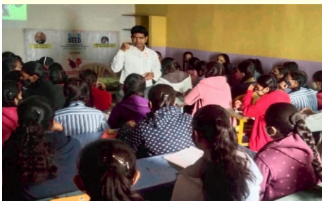
Smart Girls 1 Program

In addition, SD-SEED has also organised 10 programs on Skill Development which has benefitted over 751 students.