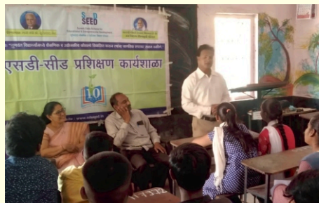
Time Management 1 Program